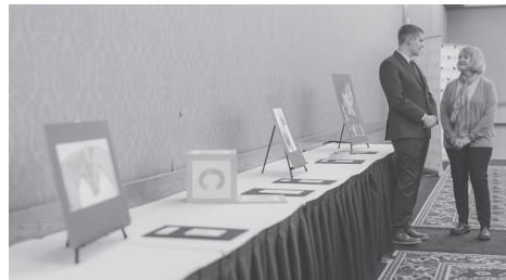
Art display by the students competing in the state art competition.