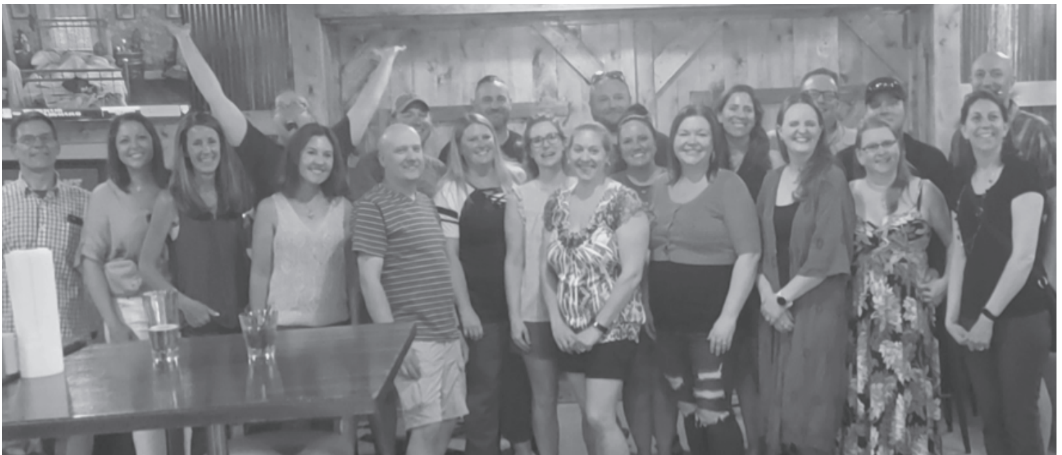
Pictured above: The Class of 1997 recently celebrated their 25th class reunion with an evening at Richie Z's.