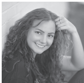
Madelyn Jungwirth Brabander Family Scholarship Recipient