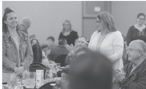
Educators were asked to stand and be recognized during the event.