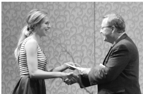
Each Scholar of Excellence was presented with a BankWest gift card from the Foundation.