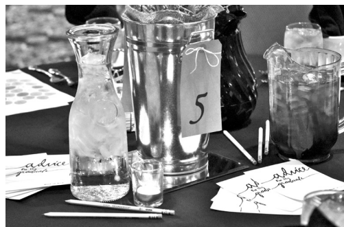
Evening of Excellence attendees had the opportunity to share advice with the scholars as they embark on new adventures and challenges.