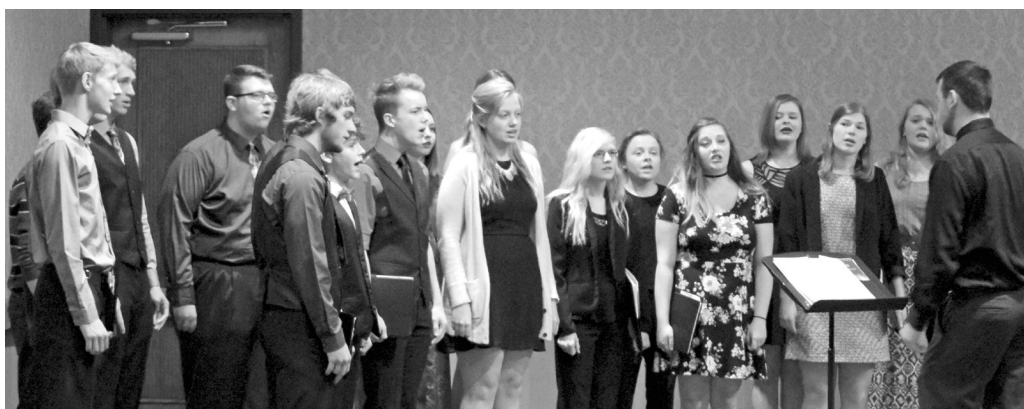
Thank you to the T.F. Riggs High School choir for providing music for the evening.